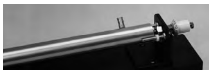
15-030 Micrometer Linear Expansion